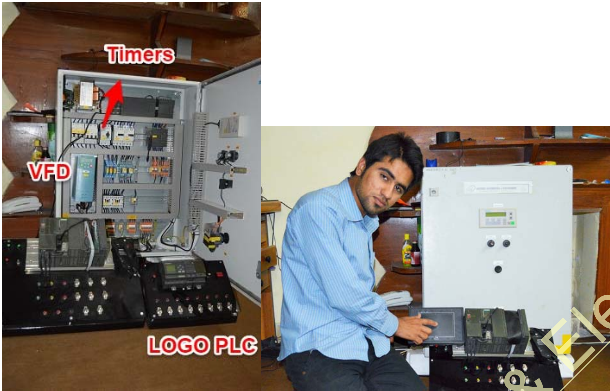
Figure 2: S7-300 PLC Kit and VFD Training Panel